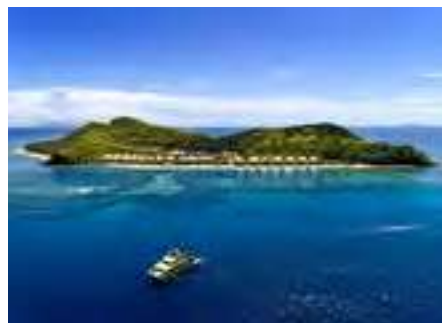
Daily Ferry Transfers