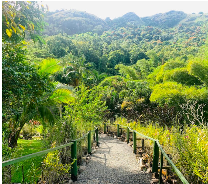
The Garden of the Sleeping Giant