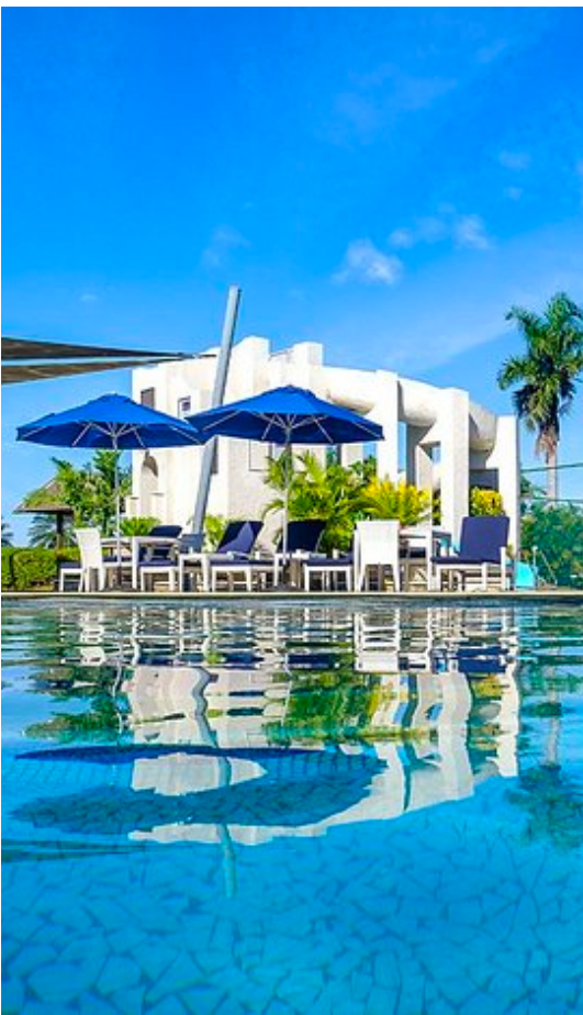
Fiji Gateway Hotel