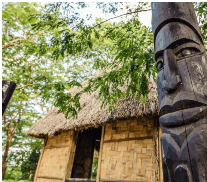
The Fiji Culture Village