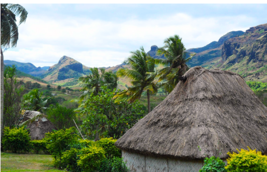
Navala Village, a 2 hour drive from Nadi town

When visiting Fiji, you may want to explore the mainland before or after your stay at Lomani Island Resort. The hotel can assist you with getting around to see the best of what the island has to offer. Here are our top options: