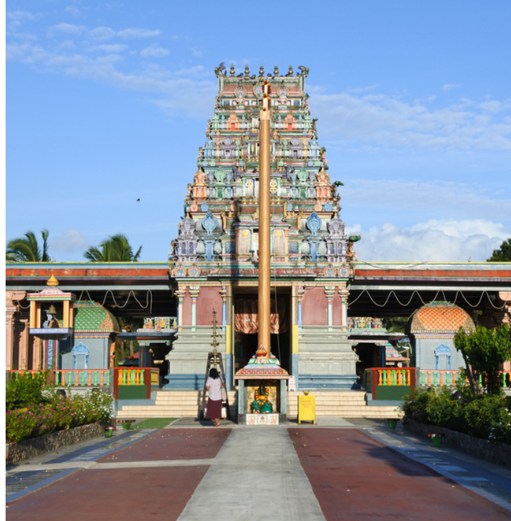
Sri Siva Subramaniya Temple