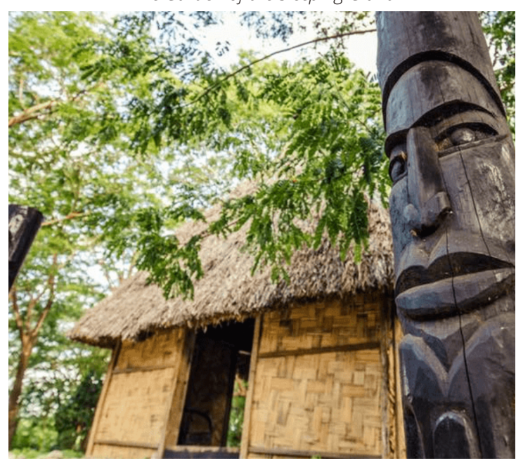
The Fiji Culture Village