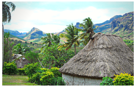
Navala Village, a 2 hour drive from Nadi town

When visiting Fiji, you may want to explore the mainland before or after your stay at Lomani Island Resort. The hotel can assist you with getting around to see the best of what the island has to offer. Here are our top options: