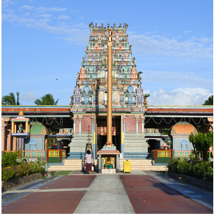
Sri Siva Subramaniya Temple