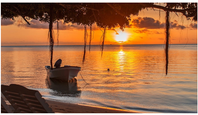
Take a sunset cruise: Watch the sun dip below the horizon from the comfort of a private boat.