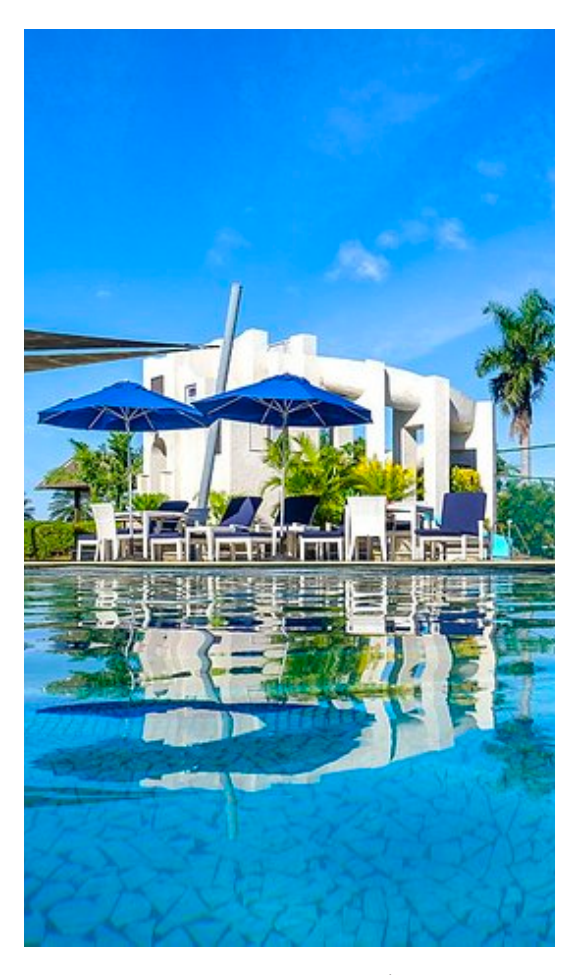
Fiji Gateway Hotel