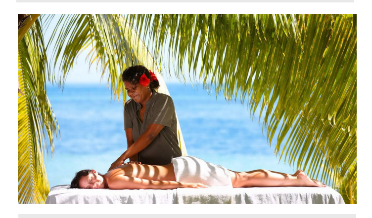
Relax at a spa: Indulge in a couples' spa treatment or a massage to help you unwind and recharge.