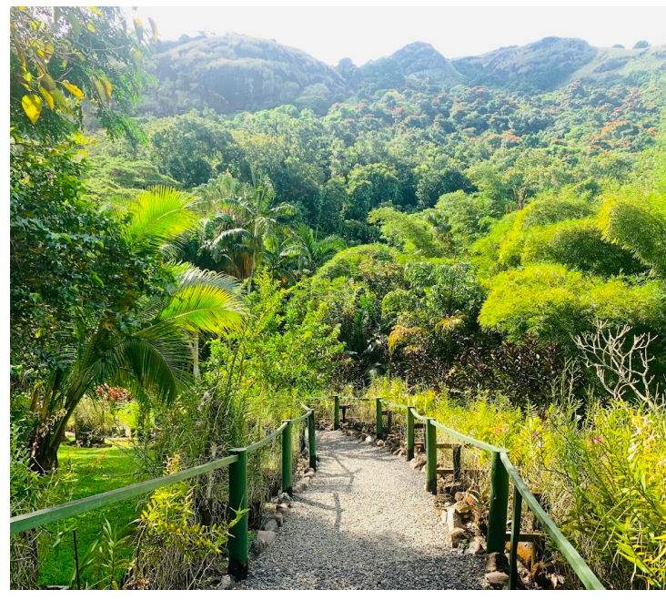
The Garden of the Sleeping Giant