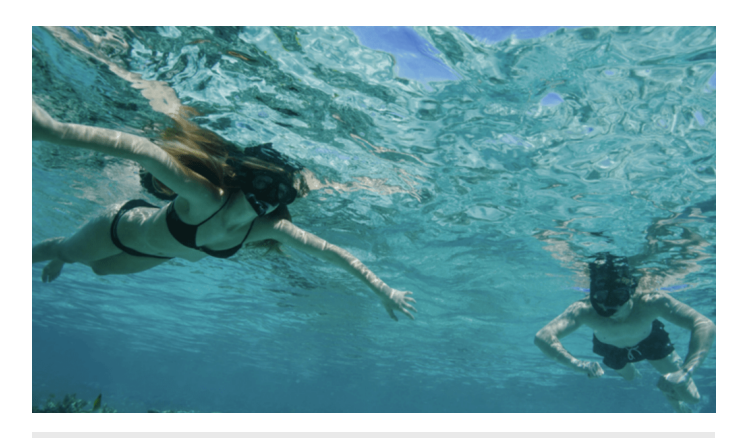
Discover Fiji underwater: Visit a unique underwater museum or go snorkeling from a private white sandy beach.

Fiji is more than just a destination; it's a way of life. From the warm and friendly locals to the stunning natural beauty, Fiji is a place where happiness comes naturally. Here are some of the best things to see and do during your romantic Fiji holiday, all accessible right from Lomani Island Resort: