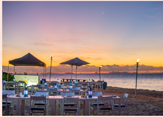
Beach area in front of The Restaurant