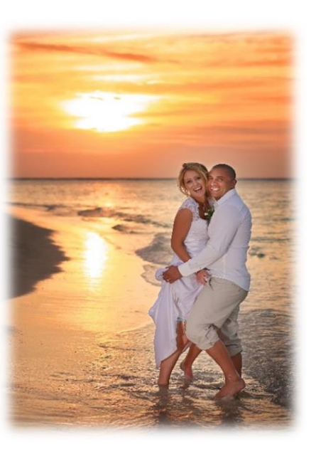
'The most ordinary things could be made extraordinary, simply by doing them with the right people'...

Mana Island Resort & Spa - Fiji, nature is in its truly elegant state, with clear –crystal waters, fresh fragrant and indescribable backdrops, creating romance and magic for couples and honeymooners.